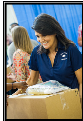
S. Carolina Governor, Nikki Haley

Health kits are valued at $12.00 and you can see the list of items included in that kit at http://www.umcor.org/UMCOR/Relief-Supplies/Relief-Supply-Kits/Health